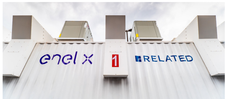
Gateway Center shopping complex in Brooklyn, NY